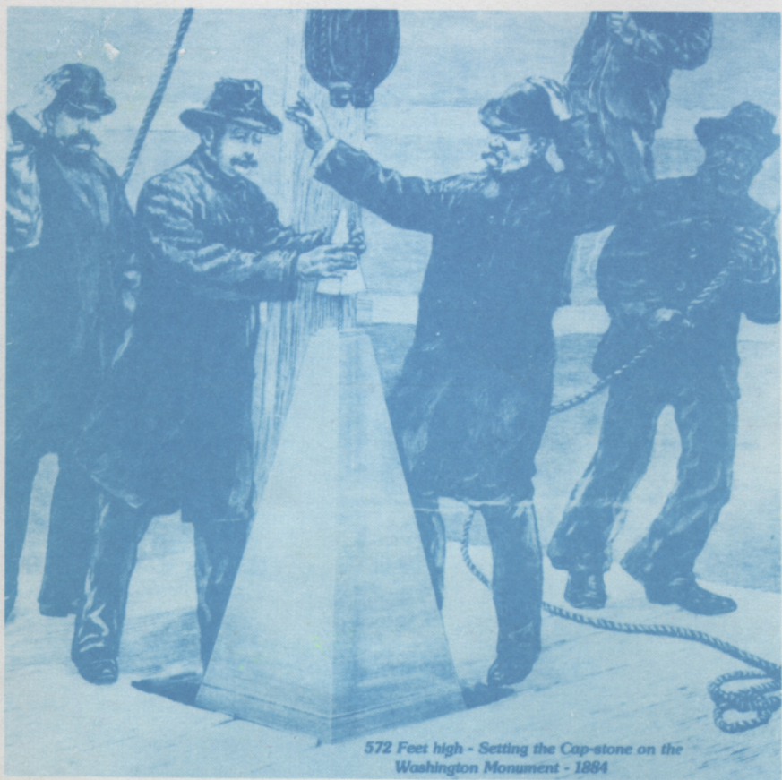
572 Feet high - Setting the Cap-stone on the Washington Monument - 1884